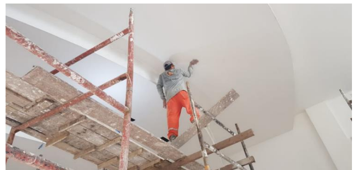
Figure 3: Services in height, with scaffolding and without the use of seat belts.