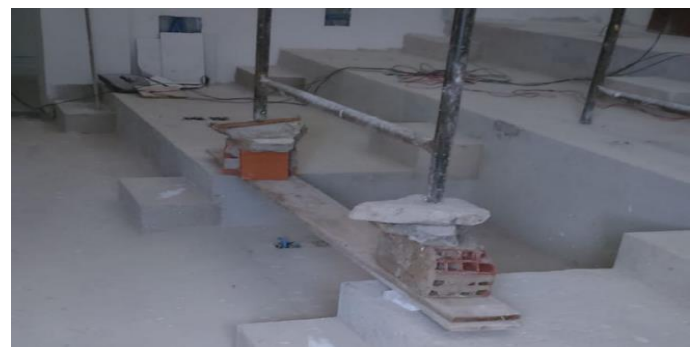
Figure 6: Demonstration.

After the application of the questionnaires in the companies, it was observed that many collaborators claimed to know the risks that were exposed, but in fact, were unaware of all the risks, for example, during the research it was observed that some of them that Worked directly in the concrete mixer inhaling the "powder" of the cement, and did not use a mask for protection, at the risk of future health problems, another item observed is that they work at heights of 8 to 10 m and wore the belt only of embellishment, because the same was not fixed in anything that ensured its safety in the event of an accident, still at that point the scaffolds are under bricks at risk of bursting and causing the accident, as shown in the picture 6.