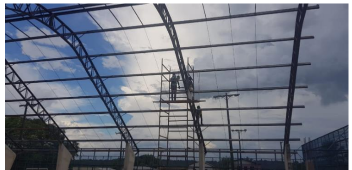
Figure 2: Services in height, with scaffolding.

The questionnaire was divided into two stages, in the first, questions of basic PPE, used in all and any services and the second with questions but specific about the use of safety and PPE in height services with the use of scaffolds, because During the on-site visit, it was observed that both builders used scaffolds in their daily services, with expressive heights, as shown in Figure 2 and 3.